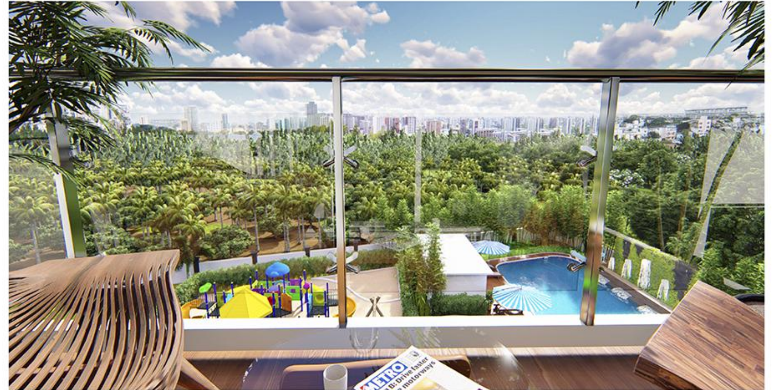
2 & 3 BHK Luxury Apartments @ Uttarahalli main road